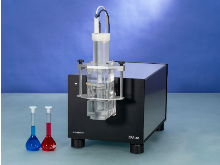
Picture 1: The ZPA 20 zeta potential analyzer uses the patented method of bidirectional, oscillatory streaming potential and streaming current analysis.