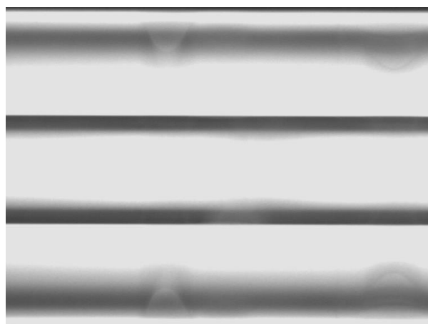
Figure 2: Image section of the above drop at 10.000 rpm