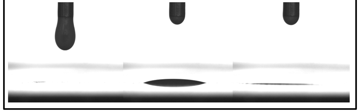
Picture 1: Sequence of drop placement and spreading (timescale is in ms range)

To further explain the mechanism behind it, SEM was used to demonstrate different surface microstructures of the coatings. The bulges on the surface of PTMS-6 coating were small (around 100 nm) and discrete. When the amount of PTMS increased, more bulges with bigger size (PTMS-8; around 200 nm) could be seen on the surface with somewhat overlapping. A worm-like structure formed on the surface of PTMS-10, which can mainly be attributed to the aggregation and deformation of particles with high amount of PTMS in the preparation process. This illustrates the importance of the surface microstructures for tuning the antifogging and antireflective behaviors.