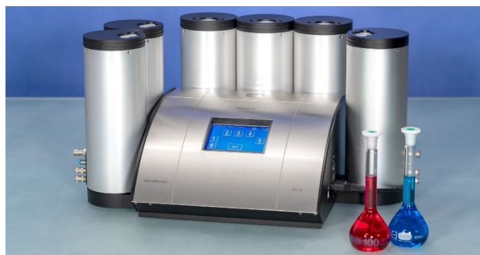
Fig. 2. DataPhysics Instruments stability analysis system MultiScan MS 20 with six independent Scan Towers

Therefore, MS 20 is an ideal device for evaluation of mean particle size.