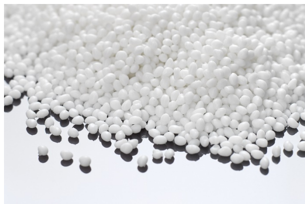
Fig. 1. Samples of polystyrene particles

The MultiScan MS 20 (Fig. 2) from DataPhysics Instruments is a measuring device for automatic optical stability and aging analysis of liquid dispersions as well as the comprehensive characterisation of time- and temperature-dependent destabilisation mechanisms . It provides an easy and fast way to measure mean particle size in native dispersions. The mean particle size evaluation of two commercial polystyrene particles using an MS 20 device will be presented in this application note.