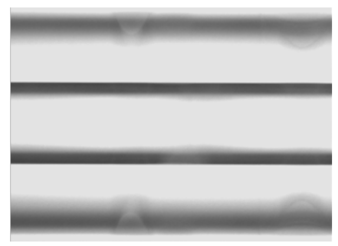
Fig. 4. Image section of the above drop at 10000 rpm

Variation of the rotational speed of the capillary can influence the elongation of the drop. The shape of the drop becomes more cylindrical for higher rotational speeds. Different drop shapes for a surfactant-oil system with rotational speeds of 6000 and 10000 rpm are shown in Fig. 3 and Fig. 4. The software enables the possibility to calculate the interfacial tension between the liquids according to different image sections. If the elongated drop is bigger than the displayed image section it is possible to calculate the interfacial tension by analyzing the left or right end of the drop, or even by the cylindrical mid stage of the drop.