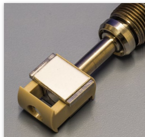
magnetic positioning system for solids